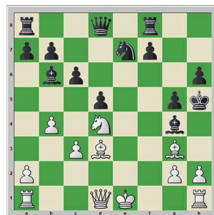
White's turn, Answer: 1.Qxg4 Kxg4, 2.Be2#