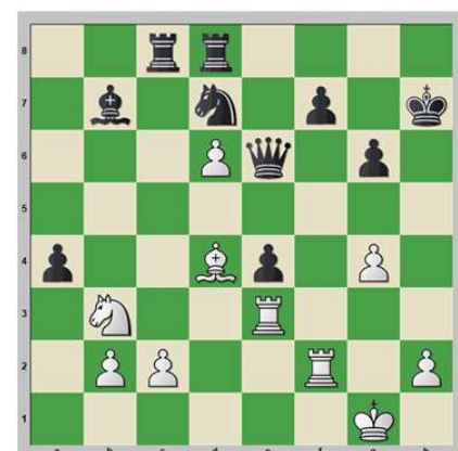
White's move, Answer: 1. Rh3 Kg8, 2. Rh8 #