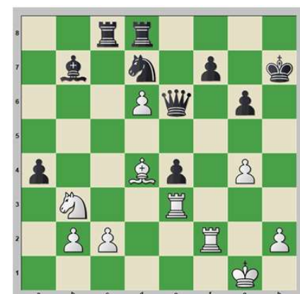
White's move, Answer: 1. Rh3 Kg8, 2. Rh8 #

Chess is more than a mind's game, it takes you into a world of power play. Your time will be well spent, developing your mind. Checkmate is more fun than you can imagine. Join our chess class, register now,,,