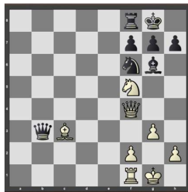
White Mates with Minor Pieces 1 Nh6+ Kh8 2 Qxf6 gxf6 3 Bxf6#