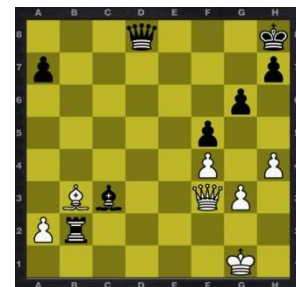
White mates in 2 1, Qxc3! Qd4/Qf6, 2, Qxd4/Qxf6#