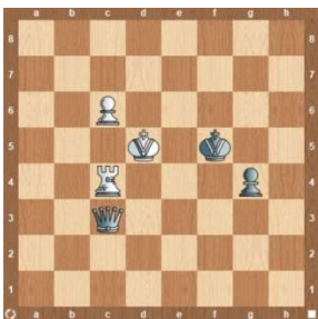
White mates in 1 Qe5#