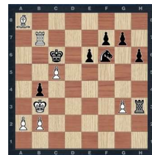
White mates in 2 1, Kc4 Rxg3, 2, Rx7#