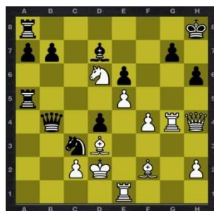
White mates in 2 1. Qxh6+ gxh6 2 Nf7#