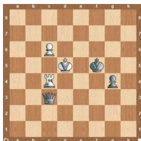
White mates in 1 Qe5#

Phone: 9215 2682 Email: hoyinpingchess@gmail.com Website: www.hoyinpingchess.com