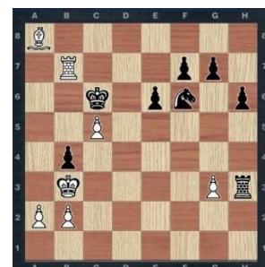
White mates in 2 1, Kc4 Rxc3, 2, Rxf7#